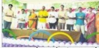
కళాశాల వార్షికోత్సవంలో మట్టి గణపతులతో